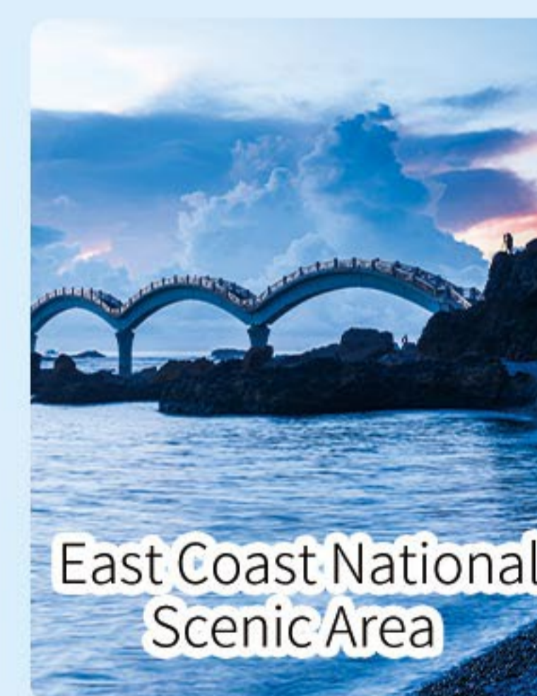
East Coast National Scenic Area

Arrange for English/Chinese (Mandarin) tour guide