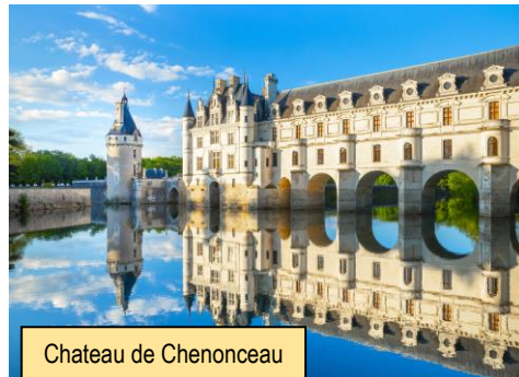
Chateau de Chenonceau

Accommodation : Mercure Hotel or similar