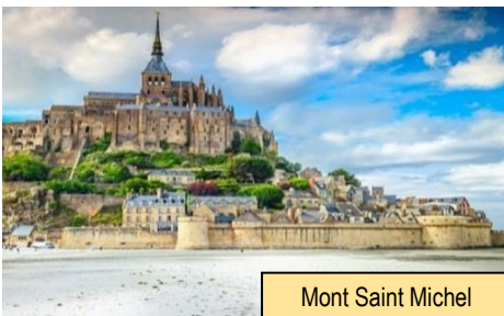
Mont Saint Michel

Accommodation : Mercure Hotel or similar