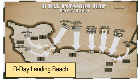
D-Day Landing Beach