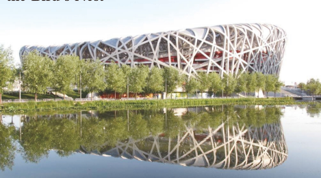
the Bird's Nest

Optional tour: Tiananmen Square Night Drive by tour with Beijing Duck Dinner -- $29/per person.