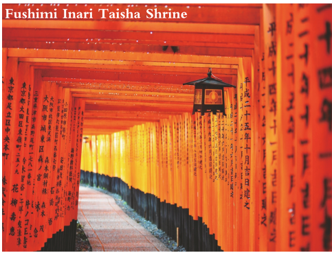
Fushimi Inari Taisha Shrine

After breakfast, head to Arashiyama Bamboo Forest, then the Togetukyo Bridge. After, visit the famous Golden Pavilion, a temple with floors covered in golden leaves. Then, visit a traditional brewery to taste and learn the brewing process of sake. Afterwards, visit the Fushimi Inari Taisha Shrine. Located in Southern Kyoto, the shrine serves the god of agriculture. Enjoy free leisure time afterwards. Dinner is on your own arrangement. (B/L)