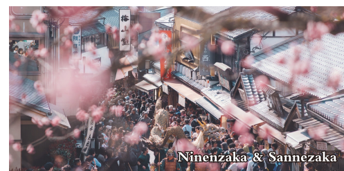
Ninenzaka & Sannezaka

After breakfast, a free pick-up service is available for all flights arriving at Osaka Kansai Airport Terminal 1 during 11am to 9 pm. Please provide your flight number before the tour. We will have a guide onsite to assist you to take a free shuttle to the hotel. Travelers who arrive at the other times can take the free shuttle bus on their own to the hotel as well. Hotel check-in is available after 3pm with your passport. (B)