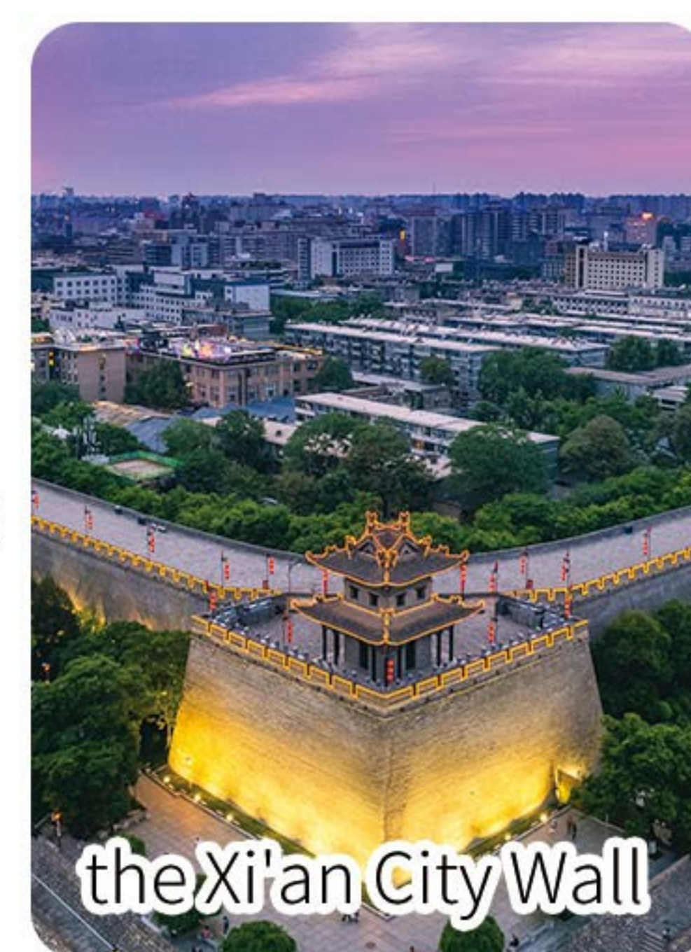
the Xi'an City Wall

After breakfast, transfer to the airport and end of a pleasant journey.