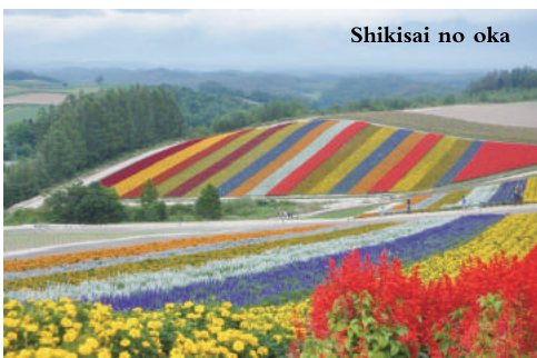
Shikisai no oka

Arrive at Sapporo New Chitose Airport, guests will be picked up at the airport and be transferred to the hotel with the help of a tour guide. (Guests who arrive early/late can check-in on own after 3 pm with the passport) Today's schedule has no meals included.