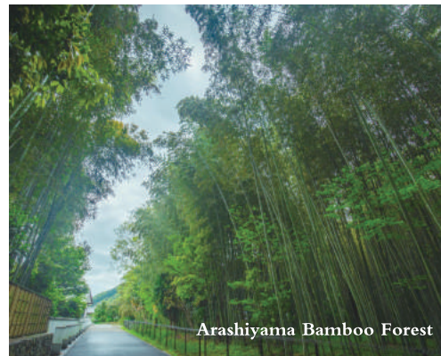
Arashiyama Bamboo Forest

After breakfast, take limousine bus on your own expense and arrangement from the hotel to the airport for the homebound flight. The end of journey. (B)