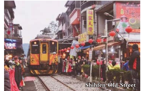
Shihfen Old Street

appreciating the Shihfen waterfall, we proceed to the old street where you can set up the sky lanterns (Not included, purchase on own). Shihfen Old Street is famous for the wonders of the streets, shops and crowds right aside the train lane. You will experience a whole different type of street market. Enjoy the famous Champion Beef Noodles in Taiwan for dinner. (B/D)