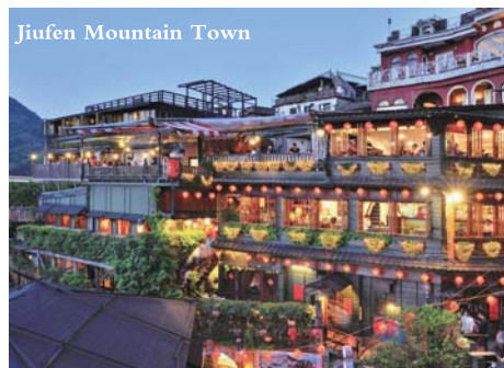
Jiufen Mountain Town

busy port and economic center years ago. After a hundred years, Lugang Old Street has also been rated as a two-star attraction by the international tourism and food industry authority "Michelin". From the old street tour, you will see the famous Tianhou Temple, Ding Ancient House, Nine-turn lane. Enjoy Taiwanese cuisine for lunch. Later, proceed to Rainbow Military Community, filled with many colorful paintings on the walls of houses. After, stop at Taichung Opera House, designed by Japanese architect Ito Kazuo, who was awarded the Pritzker Prize. The opera house is an astonishing architecture in the city. In the evening, go to Fengjia Night Market to enjoy the delicious Taiwanese snacks from the night market. Fengjia Night Market is the largest and one of the most famous sightseeing night markets in Taiwan. Dinner is on own arrangement today. (B/L)