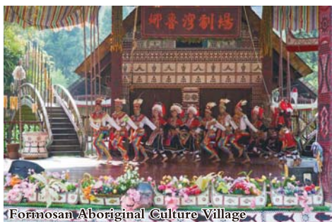
Formosan Aboriginal Culture Village

After breakfast, visit one of the most popular spots in Taiwan, Sun Moon Lake Scenic Area (including cruise + cable car), which is the largest freshwater lake in Taiwan, covering 900 hectares. This area is the holy land for the Shao aborigine in Taiwan. The northern part of the lake is shaped like the sun, the southern half is shaped like the moon; hence its name. Enjoy Aboriginal Cuisine for lunch. Later, proceed to Formosan Aboriginal Culture Village, located in Nantou County. Formosan Aboriginal Culture Village is a theme park full of entertainment, cultural experience activities and traditional song/ dance performances. It is a great place to see a combination of Taiwanese recreation, tourism and education. The Formosan Aboriginal Culture Village is known for its aboriginal cultures, which offers a new insight of Taiwan! In addition to cultural experiences, you can also ride the fun roller-coaster and etc. During some seasons, the village offers seasonal performances or shows, such as a welcome ceremony, blessing ceremony, thorn blessing, ramie, and a historical museum visit. Enjoy a Shaoxing banquet for dinner. (B/L/D)