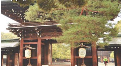
Meiji Jingu Shrine

Free pick-up service is available for all flights, which arrive from 10:30 am to 9:30 pm at Tokyo Narita Airport Terminal 1 & 2. Please provide your flight number before the tour. We will have a guide onsite to assist you to take the free hotel shuttle to the hotel. Travelers who arrive at the other times can take the free shuttle bus on own to the hotel. The location of Hilton Free Shuttle Bus Stop: Waiting area 16 at Terminal 1 and Waiting area 26 at Terminal 2. The last shuttle bus departing at 10:30pm. If the guests arrive after 10:30, please take taxi on own expense (approximately 20 USD) to the hotel. The hotel check-in is available after 3pm with your passport.