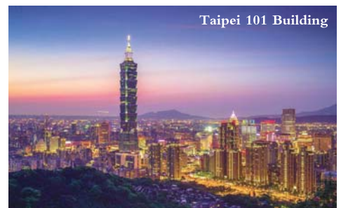
Taipei 101 Building

After breakfast, coach to the aboriginal souvenir center and shops to get some Taiwanese snacks or gifts for you and your family. Later, proceed to National Palace Museum, displaying a collection of ancient Chinese artifacts. The collections are worldwide and have covered different dynasties in the 5000-year history of ancient China. Afterward, visit Martyr's Shrine, the shrine was built to honor the fallen Kuomintang soldiers after the Chinese Civil War. Enjoy Taiwanese Pork Rice for lunch. After lunch, visit Sun Yat-sen Memorial Hall, containing displays of Sun's accomplishments from the revolution during and after the fall of the Qing Dynasty. Today, it is a meeting ground for various social, educational, and cultural activities. Then, head to Taiwan's landmark, the Taipei 101 Building, which has a shopping mall and offices. It is currently the ninth tallest building in the world. The building has the world's largest damper and the fastest elevator in the world. You can take the elevator to the observation deck to overlook the panoramic view of Taipei at your own expense. Enjoy DinTai Fung for dinner. (B/L/D)