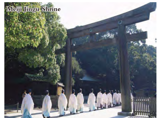
Meiji Jingu Shrine

Head to Kamakura to visit the famous World Cultural Heritage Site - Kamakura Big Buddha,