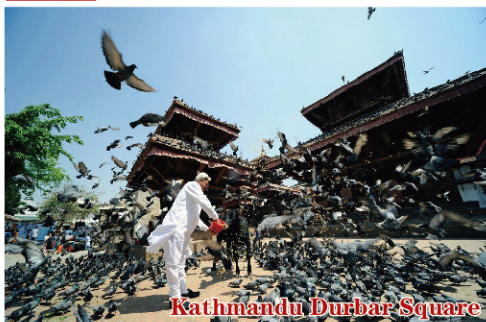
Kathmandu Durbar Square

Hotel:Hotel Shankar / Hotel Himalaya or similar