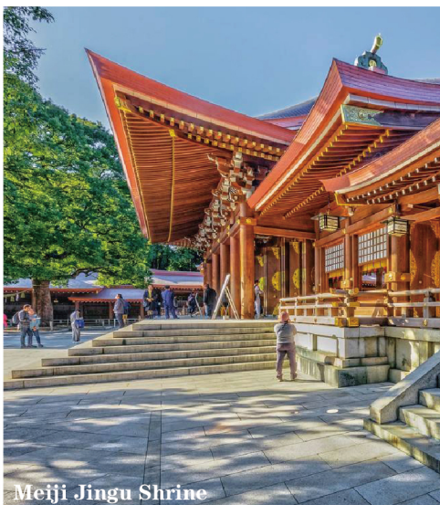
Meiji Jingu Shrine

Hotel: Tokyo Prince Hotel or Shinjuku Granbell Hotel or Tokyo Dome Hotel or similar