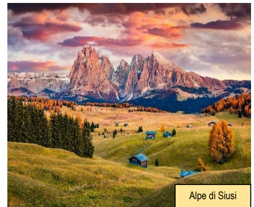
Alpe di Siusi

Accommodation: Hilton Garden Inn Milan or similar (D)