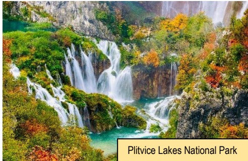
Plitvice Lakes National Park

Accommodation: Hotel Jezero or similar (B/L/D)