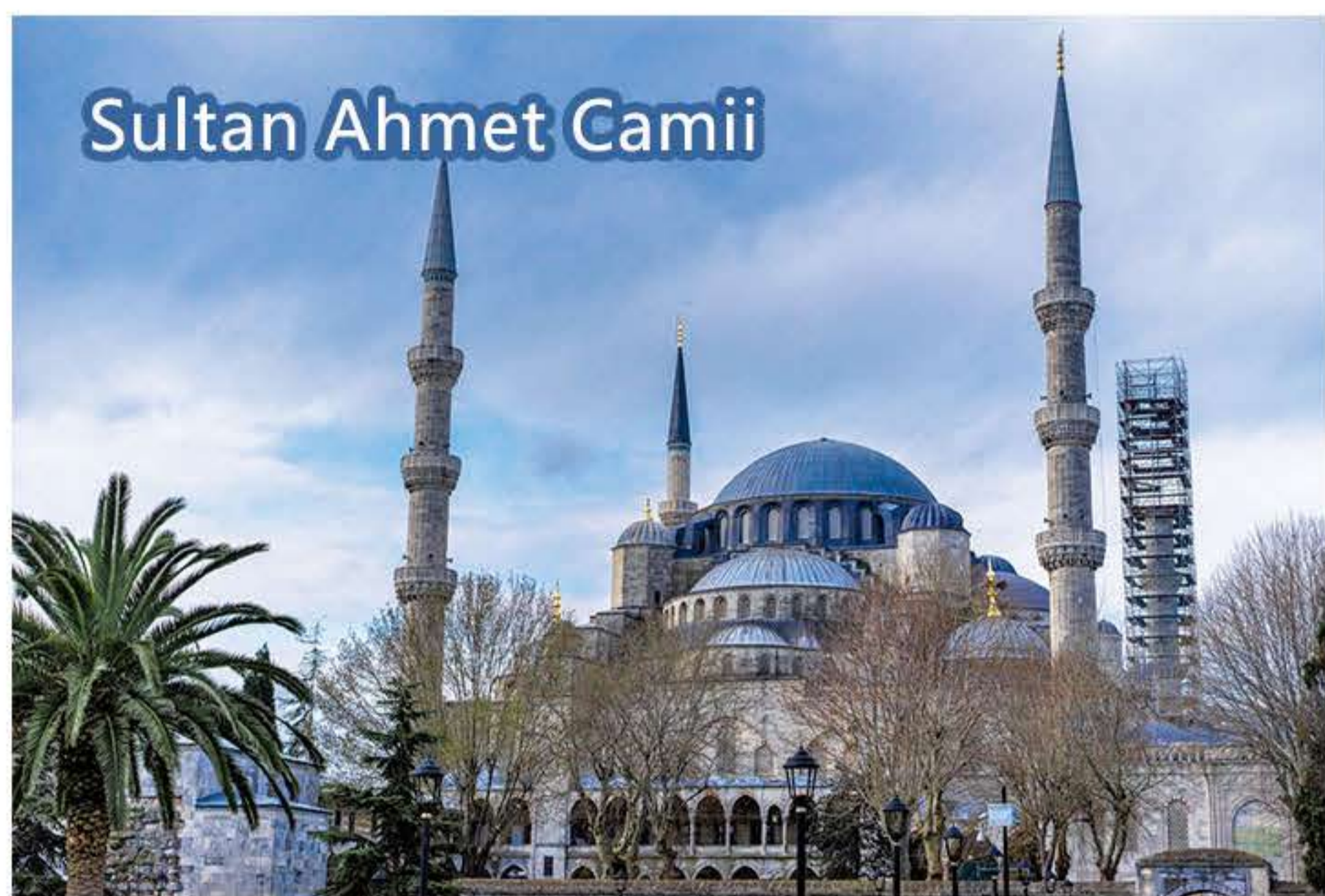
Sultan Ahmet Camii

Upon arrival at Istanbul Airport in Turkey, transfer to the hotel with our receptionist's assistance. The hotel check-in time is after 2pm.