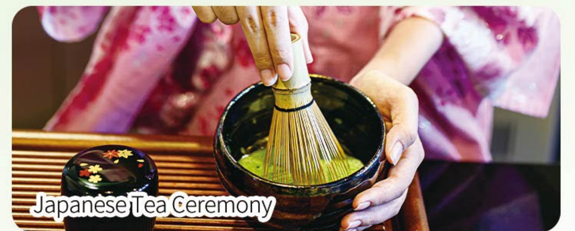
Japanese Tea Ceremony