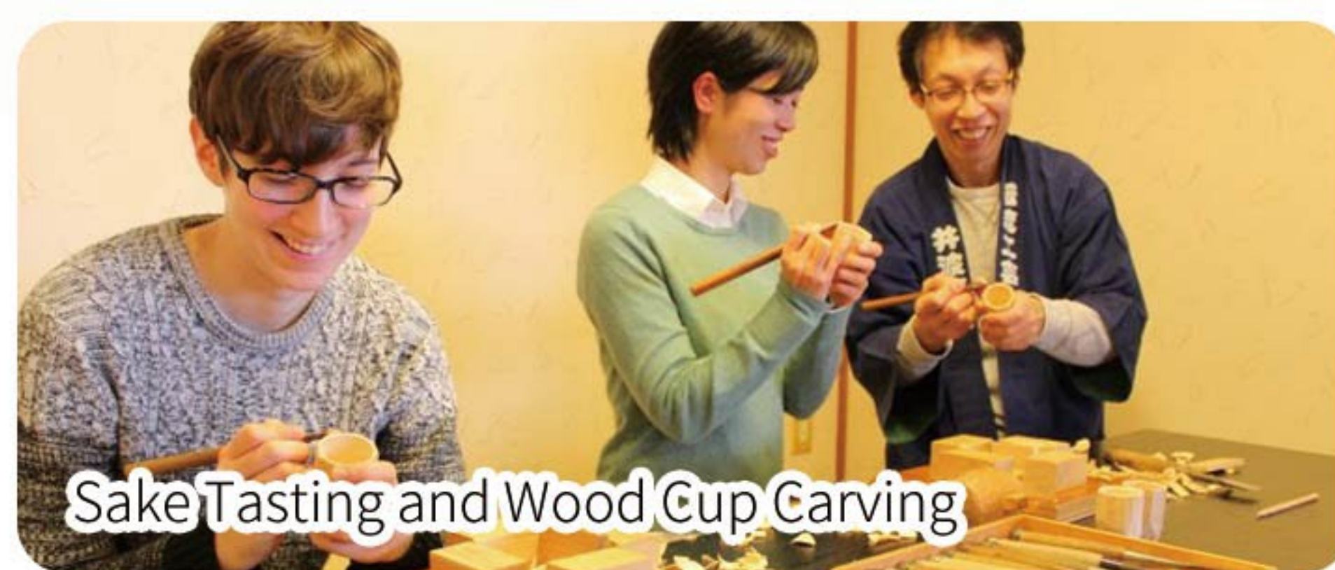
Sake Tasting and Wood Cup Carving