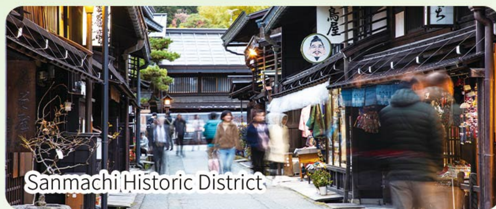
Sanmachi Historic District