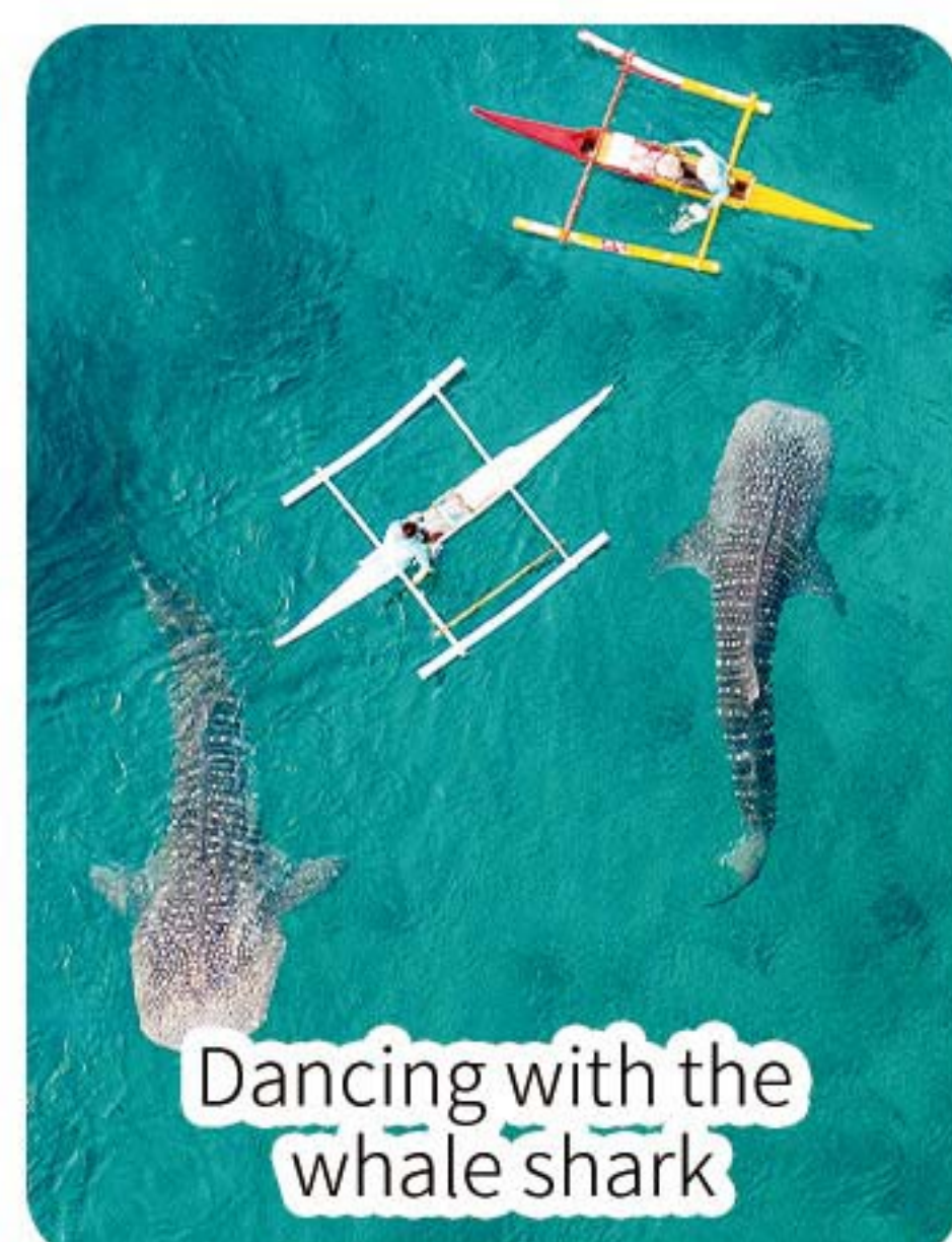
Dancing with the whale shark